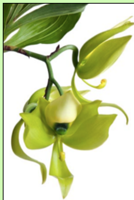
Cycnoches chlorochilon The green swan orchid.

Plants summered outdoors should begin to be prepared to be brought back into the winter growing area. Clean the plants up and be on the lookout for any pests they may have picked up during the summer. Treat as necessary.