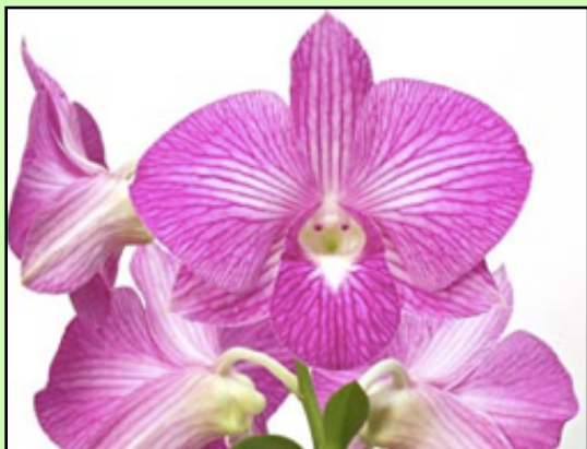
Dendrobium Burana Stripe is a popular and easy phalaenopsis-type hybrid.