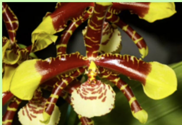
Rossioglossum grande shows off its large, dramatic flowers.

Once known as Odontoglossum grande , this is a spectacular orchid with six to eight flowers up to 8 inches across. Often known as the tiger orchid, it has bright golden yellow flowers heavily marked with chestnut brown barring. The plants are beautiful with a grey-green cast to the foliage, which is borne on succulent pseudobulbs. It prefers hot and wet summers with cooler, even down to 40 F, dry winters. Grow under filtered light. Watch for snails and slugs that eat the flowers, pseudobulbs and leaves.