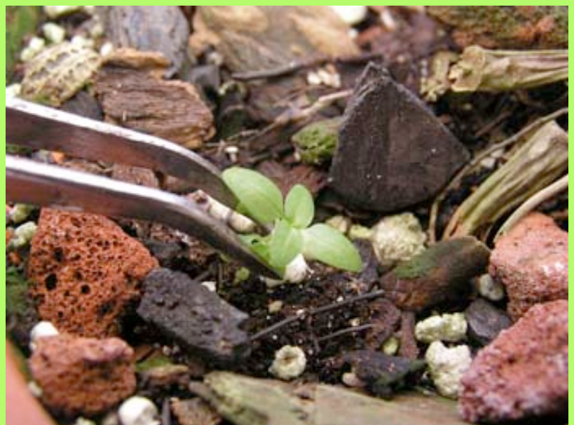
A large pair of tweezers can eliminate weeds at the stage when they are easiest to control.

Remember that physical control of these weeds includes removing not just the foliage, but also the roots or bulbs below the surface of the media as well. If a weed has become well established, it may be necessary to decant the orchid and remove all parts of the weed from the medium.