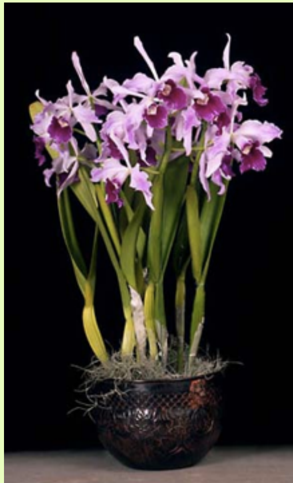
Cattleya purpurata , formerly in the genus Laelia , is without a doubt one of the most stately orchids to bloom in this season.

While cattleyas will be entering into a period of rapid growth starting this month, they have still not built up sufficient momentum to be significantly slowed by your missing a day or two of watering owing to dark weather. As always, it is safer to err on the dry side than on the wet. It is important, though, especially to the summer bloomers. Too much shade will cause rapidly developing inflorescences to droop unattractively.