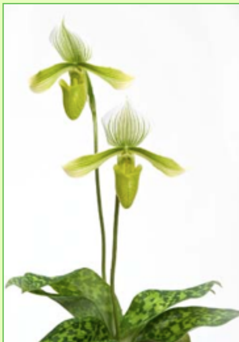
Paphiopedilum Maudiae is a perennial favorite slipper orchid.