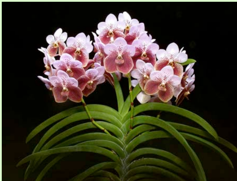
The Philippine species, Euanthe sandariana , rewards growers with massive heads of flowers at the end of summer.