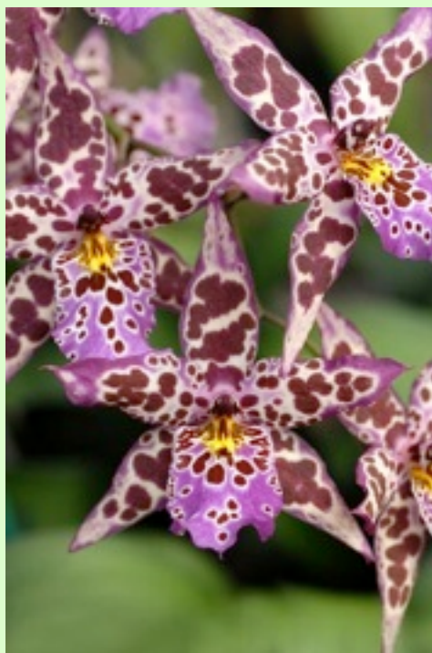
Beallara Diana Dunn 'Newberry' is a good example of the colorful patterns that Oncidium intergeneric hybrids offer.

Cattleyas this month require careful attention to their watering and fertilizing needs owing to characteristically high temperatures. Evaporative cooling is a must in areas of the country where it is effective. Where it is not (the more humid regions), care needs to be paid to proper venting to keep temperatures within reason. Bottom vents in conjunction with top vents provide enough rising airflow to help keep plants cool. Increased air flow lessens humidity and dries plants out more quickly, necessitating more frequent damping down and watering, in areas where high humidity is not a problem. Higher light and heat indicate more fertilizer. The growths your plants are making now are the source of this autumn, winter and spring's blooms, so applying adequate fertilizer this month is the best way to ensure future blooms. Higher temperatures and humidity may also lead to fungal or bacterial rot problems, so it is important to closely observe your plants for any early indication of problems. Pests are also at a high point this month for the same reason.