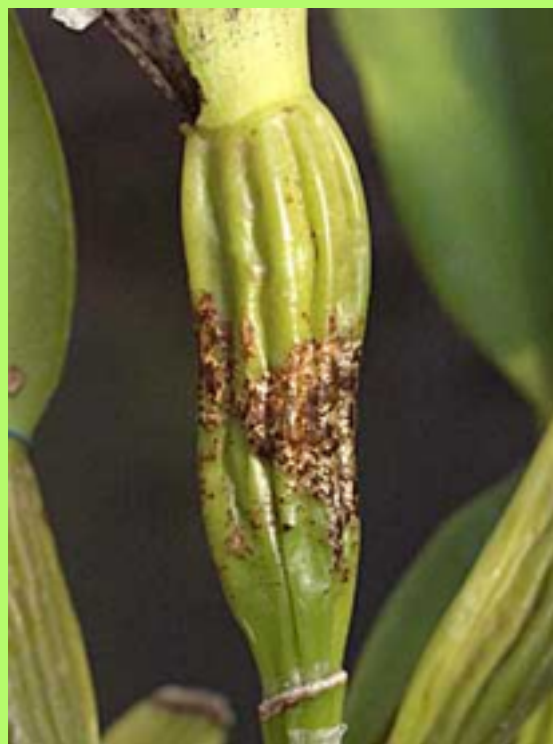
Mechanical damage can scar an orchid for life.

Take the extra time to carefully situate and protect bloom spikes and flowers against bending and breakage in transit before transporting your plants. When orchid shopping, bring along an extra stash of boxes or bags, plus some lightweight packing materials unlikely to damage your new acquisitions such as polyester batting, finely shredded paper or foam packing peanuts. Most, but not all, sellers will supply some sort of protective materials to keep the plants they sell safe during the trip to their new home, but for those times when a seller is unprepared, has run out, or is simply too busy to wrap your purchases, it helps to have one's own materials on hand.